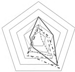
-- '96NETP -- '00NETP -- '04NETP ..... '10NETP — '16NETP